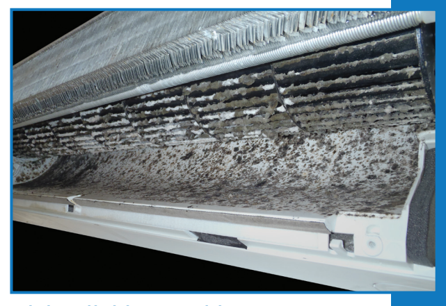
Mini-Split blower with MOLD